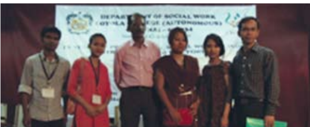
Five Students from the Department of Social Work, ADBU participated in the National Conference held on 5-6 March, 2012 at Loyola College, Chennai. The theme of the conference was, ' 75 Years of Professional Social Work in India: Contributions and way forward '